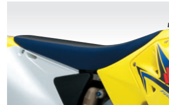
Textured surface seat

■ 249cm 3 , 2-stroke, liquid-cooled engine with a bore and stroke of 66.4mm x 72.0mm.