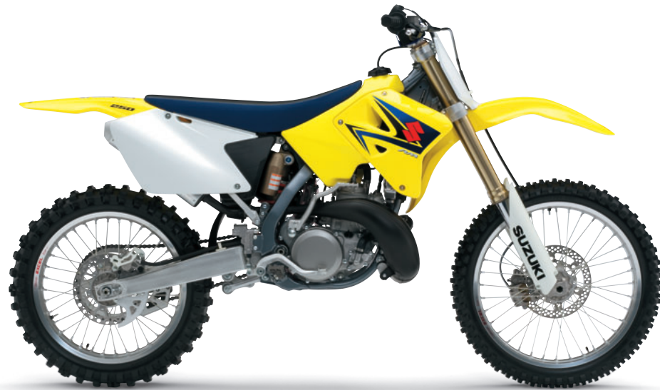
Champion Yellow No.2 (YU1)